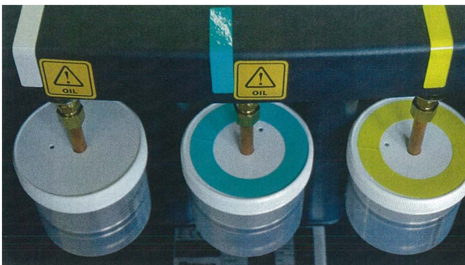
The Robinair air conditioning service device has two containers for different compressor oils.

The air conditioning system service began with the previously unfamiliar working step of refrigerant analysis. In future, it will presumably play a much greater role than in conjunction with R-134a. This