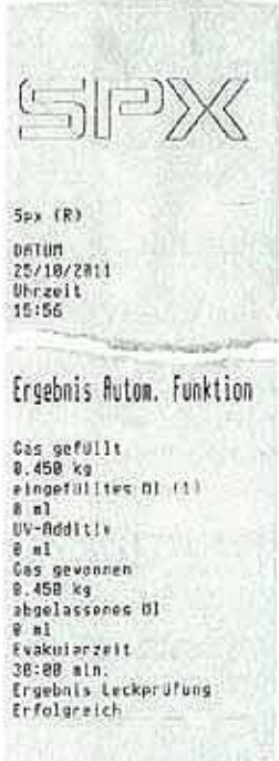
450 grams of refrigerant removed, 450 grams of refrigerant added: the report for the first R-1234yf air conditioning system service

the case. The German Association of the Automotive Industry (VDA) procrastinated for much too long in publicizing the long-accomplished conversion of R-744 (carbon dioxide, CO 2 ) to R-1234yf. This procrastination only increased the target provided to German Environmental Aid (DUH). The VDA has evidently learned nothing from this. The so-called catalog of guidelines, designated by many workshop equipment suppliers as the basis of their service device evolution, has been treated as classified information by the association. Press Officer Eckehart Rotter